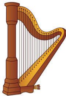
Canon in D (Pachelbel's Canon) - Arpabaleno \\ harps