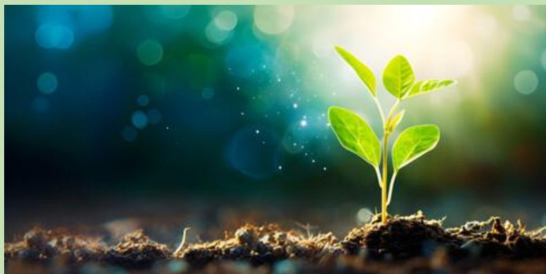
Image of the week: Our new children have settled so well and we look forward to watching them grow and flourish each day. Well done to you all on such a wonderful first week with us - you can feel very proud of yourselves!

"Every day is a new beginning. Take a deep breath, smile, and start again." - Anon